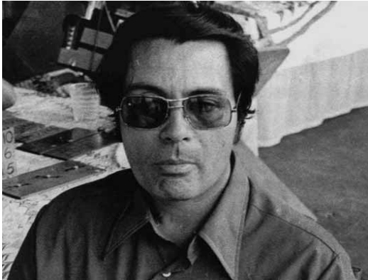
Jim Jones – People’s Temple Est. 1954 – 900 People Died

As we consult the Word of God we observe that God declares that there are many anti-Christ. The reason for this basic statement is because Scripture declares that the term literally means “Against Christ”. It is someone who opposes Christ. There have been many examples of anti-Christ in years past.